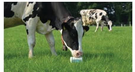
ELEMENTS PLUS grazing cattle